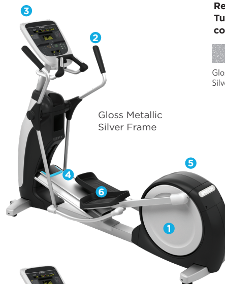
Gloss Metallic Silver Frame