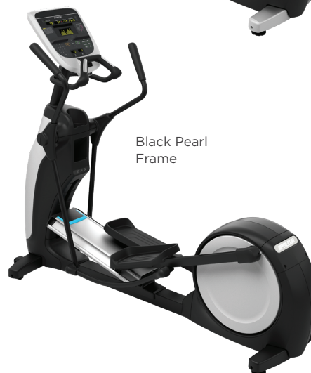
Black Pearl Frame